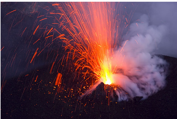
Lava fountain from a vent inside Stromboli's crater