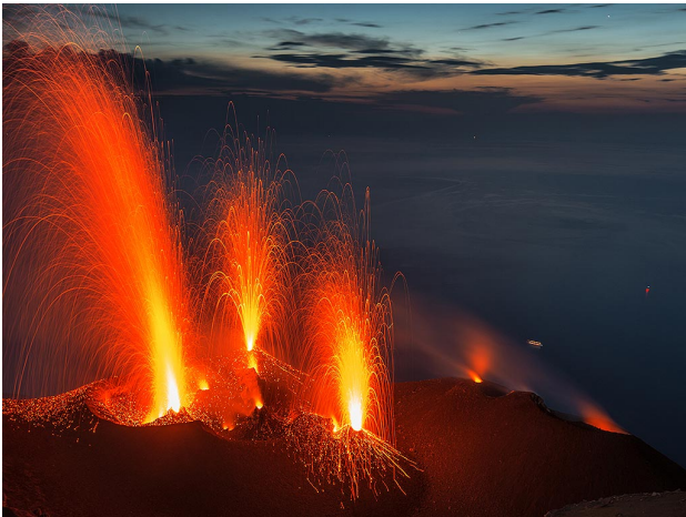
Eruption from several vents seen from Pizzo (the visitors' area)