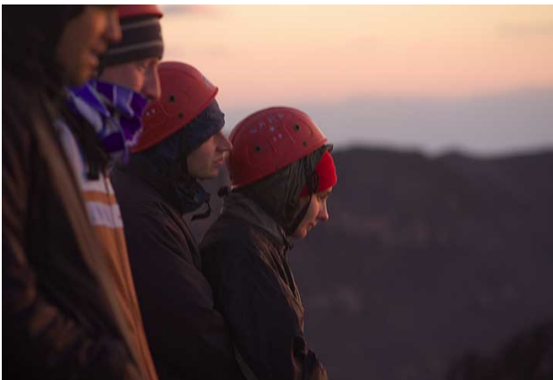
Watching Stromboli's craters

Please have a look at the detailed day-by-day itinerary further down!